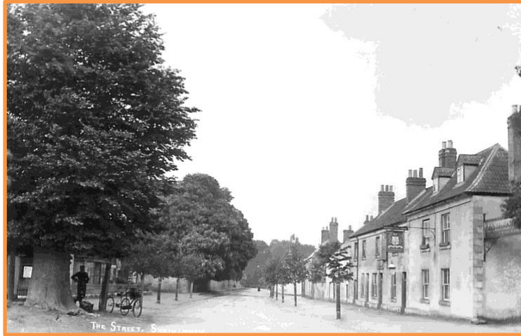
The Barrington Arms opposite the Cross Trees, Shrevenham circa 1910.