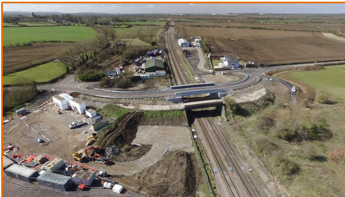
Aerial photo showing the location of the former Shrivenham Station, the Victoria Tavern on the far right, the new Railway Bridge being installed in 2016.