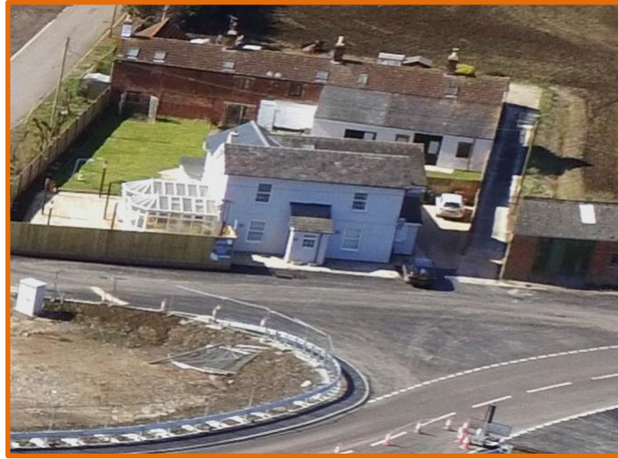
The former Victoria Tavern now a domestic dwelling.