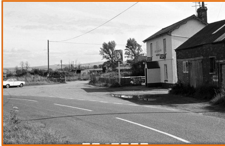
The Victoria Tavern from the 1960s.

regret that he did not pay such attention as the case demanded.' Upon hearing the verdict with the rider, the reporter for the newspaper added that he, the surgeon, 'made use of an expression unbecoming a man in his position and anything but complimentary to the jury.'