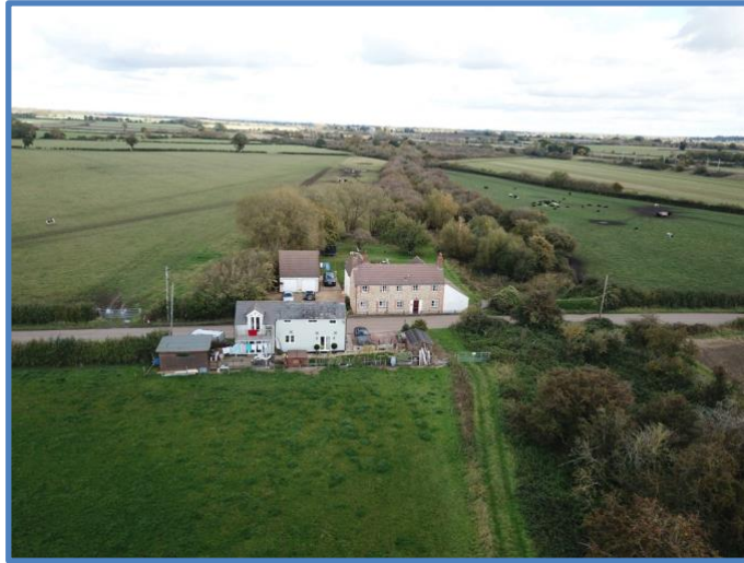
The former Jolly Waterman pub facing, cottages opposite and Canal Wharf