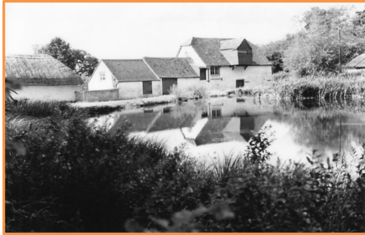
Upper Mill from across the Mill Pond circa 1920s.

and more efficient using steam for power, rendering the numerous little water mills redundant. A huge number of these mills ceased operating around this period.