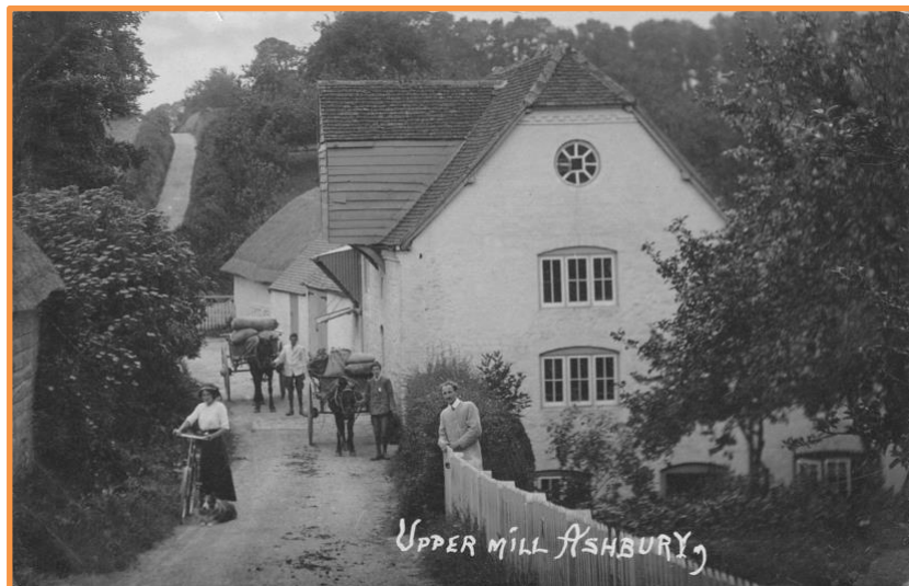
Upper Mill circa 1910.