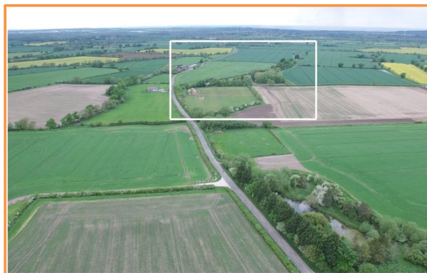
Location of North Mill - from Ashbury looking towards Shrivenham.