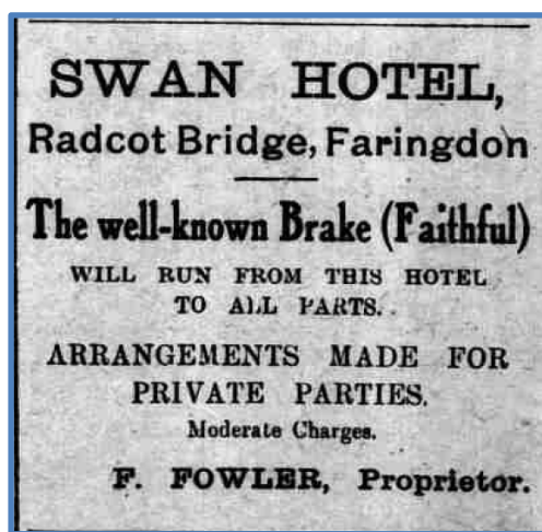
Fowler's Motor Launch - Faringdon Adver 20 th July 1912 Fowler's Brake Service - Faringdon Adver 8 th May 1909