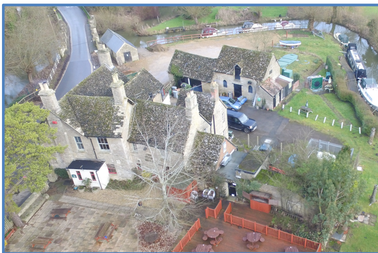
The Swan Inn above. Below - extract from Tithe Map of 1840

to the building that lies closest and parallel with the road. The two smallest buildings in the foreground seem likely to be the earliest and original Swan Inn. The outbuilding with the centre roof garret seems likely to be a stable for four horses, a building probably heavily used by the former coal merchants.