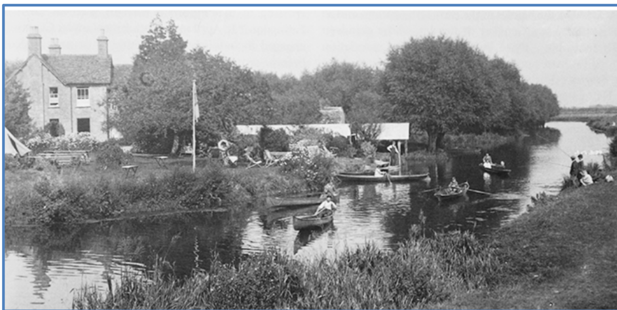
Boating on the river circa 1920s by the Swan Pub.