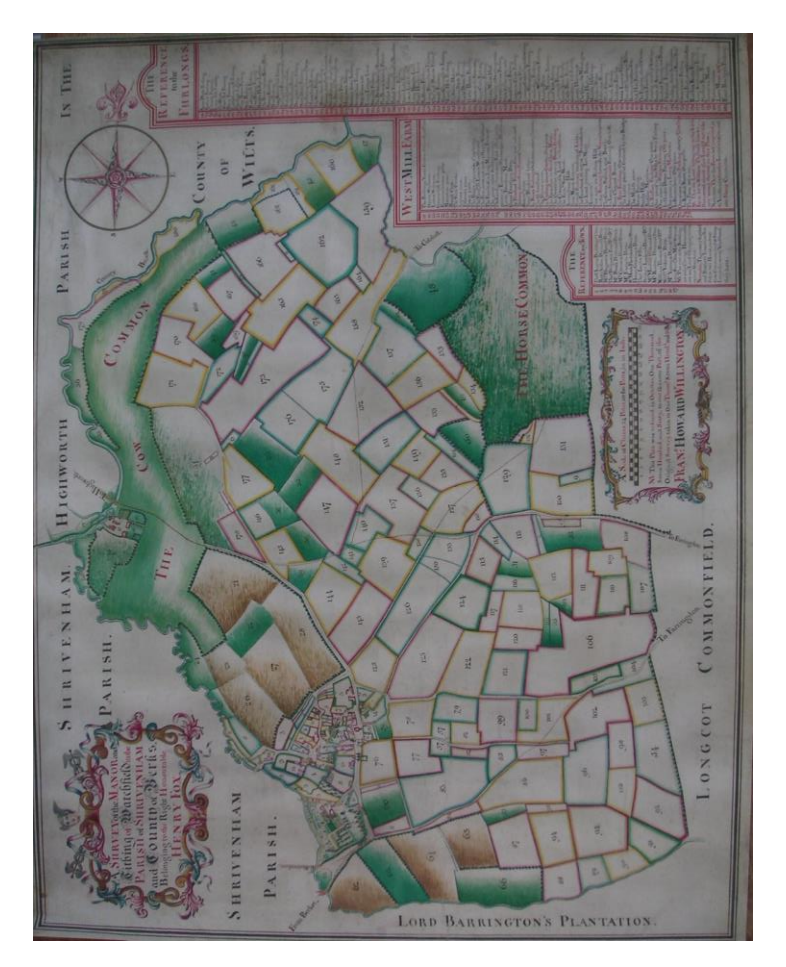
The Fox-Holland Map – oriented with North uppermost

The open fields of Watchfield were only enclosed in the 19<sup>th</sup> century but we have a map created in 1756 the land holdings of Fox-Holland in Watchfield, complete with furlong names and showing their location.